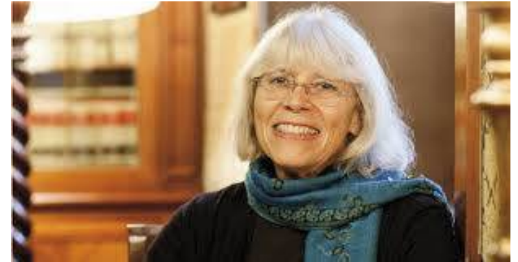
Marta Harnecker, Ideas For The Struggle (2016)