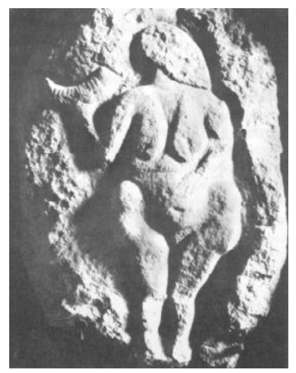
Paleolithic figurine of mother-goddess used in fertility rites (from Çatal Hüyük site, Turkey).