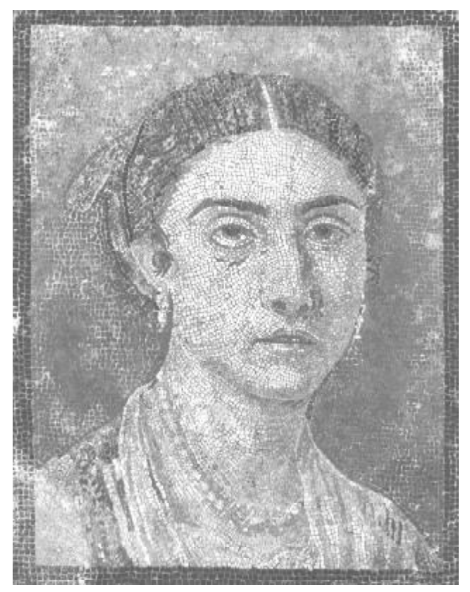
Pompei, mosaic portrait of a woman (late first century BC to early first century AD).