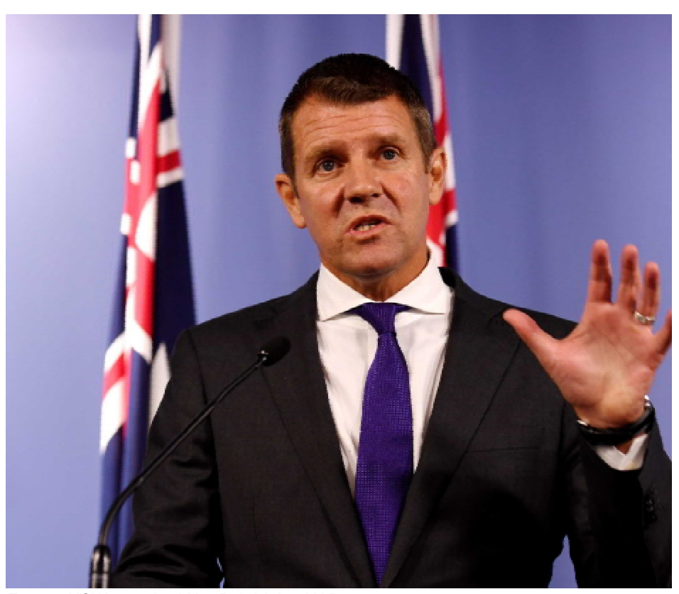
Former NSW premier Mike Baird joins NAB.

Direct deposits can also be made to Green Left, Commonwealth Bank, BSB 062-006, Account No. 00901992. Otherwise, you can send a cheque or money order to PO Box 515, Broadway NSW 2007 or donate on the toll-free line at 1800 634 206 (within Australia).