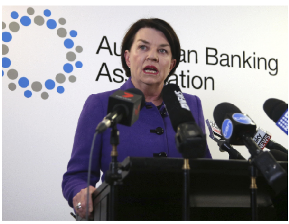
Former Queensland premier Anna Bligh heads Australian Banking Association.

Direct deposits can also be made to Green Left, Commonwealth Bank, BSB 062-006, Account No. 00901992. Otherwise, you can send a cheque or money order to PO Box 515, Broadway NSW 2007 or donate on the toll-free line at 1800 634 206 (within Australia).