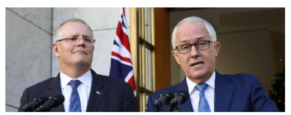
Prime Minister Malcolm Turnbull announces bank royal commission.