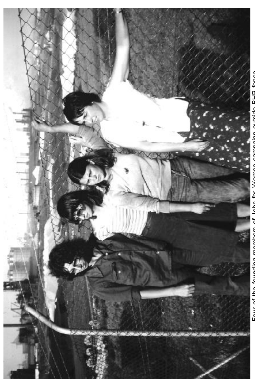
Four of the founding members of Jobs for Women campaign outside BHP fence.