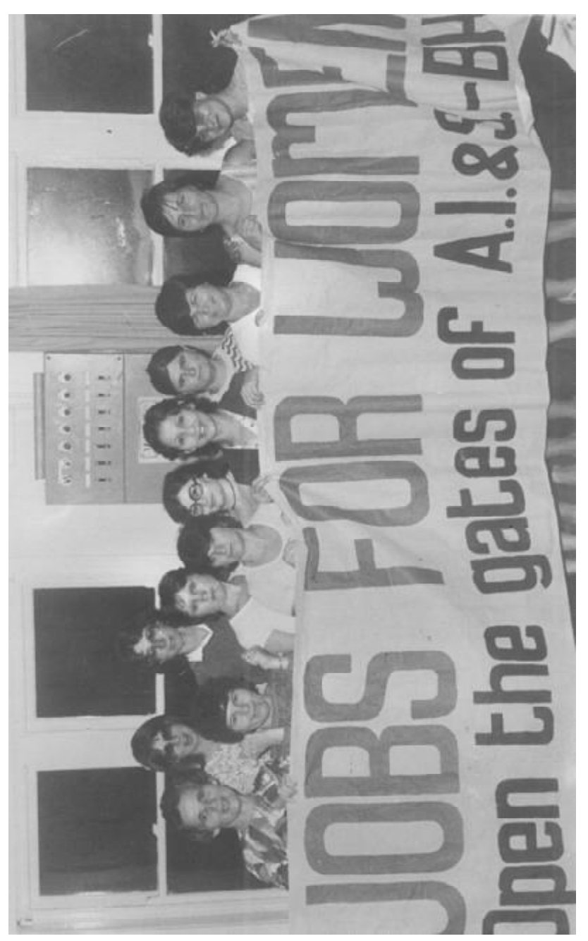
JFW campaigners with banner, February 20, 1981.