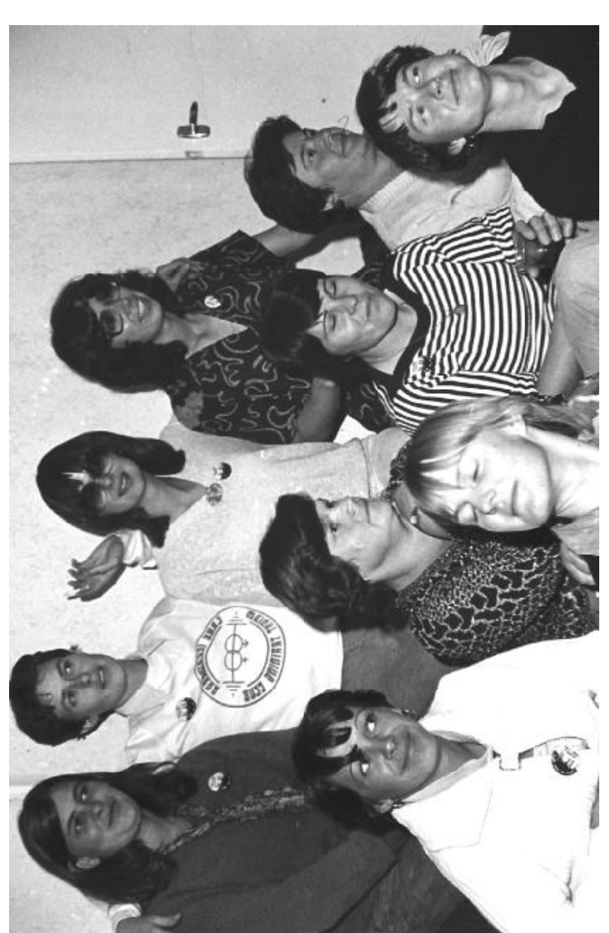
Celebrating at Illawarra Migrant Resource Centre in late 1980 after BHP's decision to hire the women complainants.