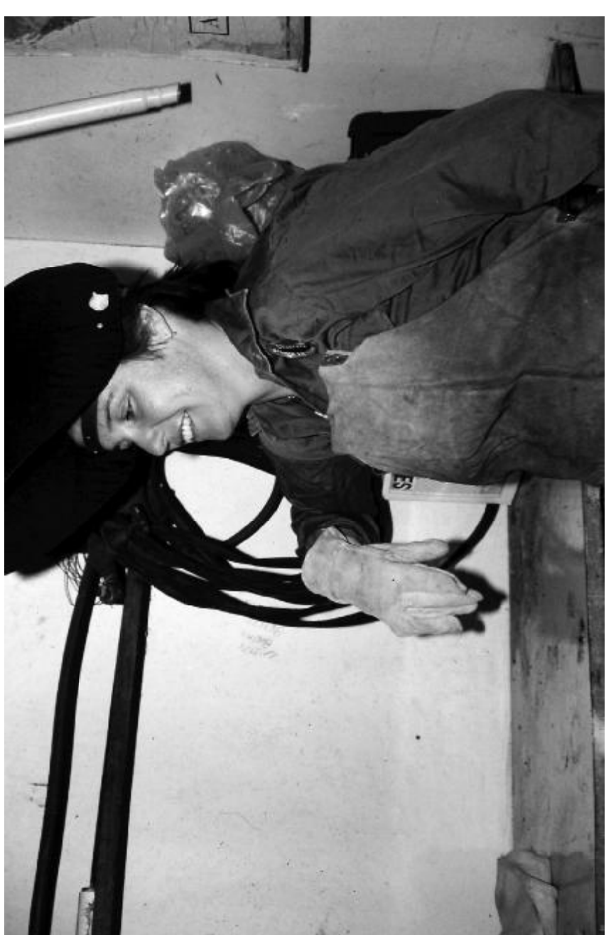
Jobs for Women campaigner gains employment as welder at BHP.