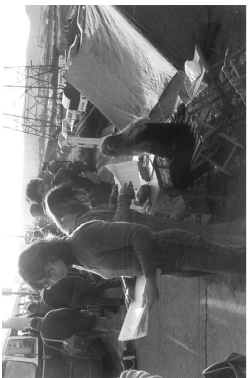
At the tent embassy.