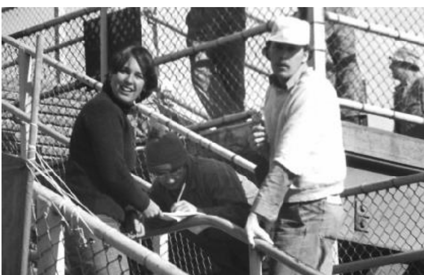
Collecting signatures on petition at tent embassy, July 1980.