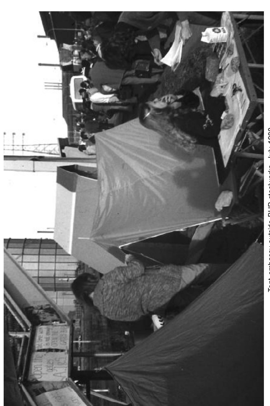
Tent embassy outside BHP steelworks, July 1980.